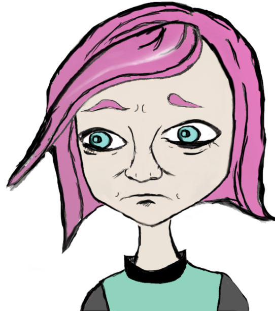
inho / tuntee inhoa