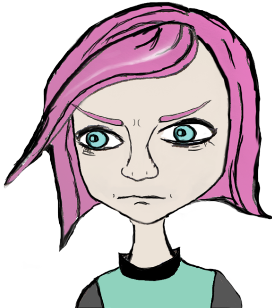
viha / vihainen