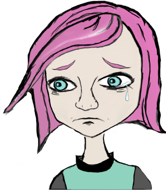
suru / surullinen